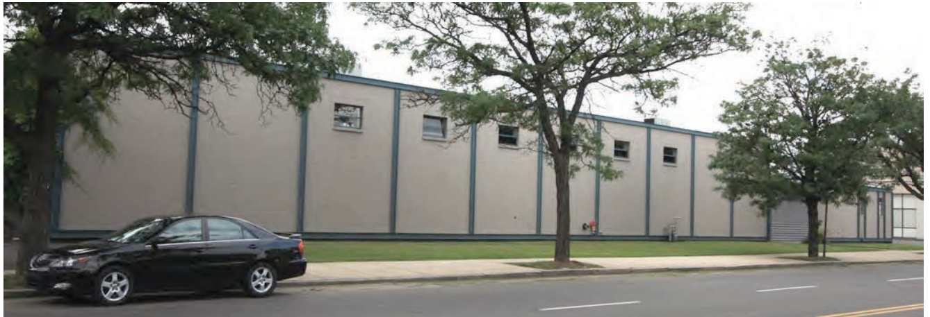
2. Southeast view of the tall block from Hamilton Street, camera facing northwest.