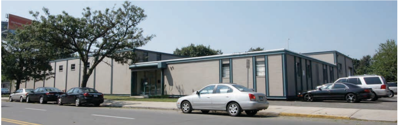
1. Northeast view from Hamilton Street, camera facing southwest.