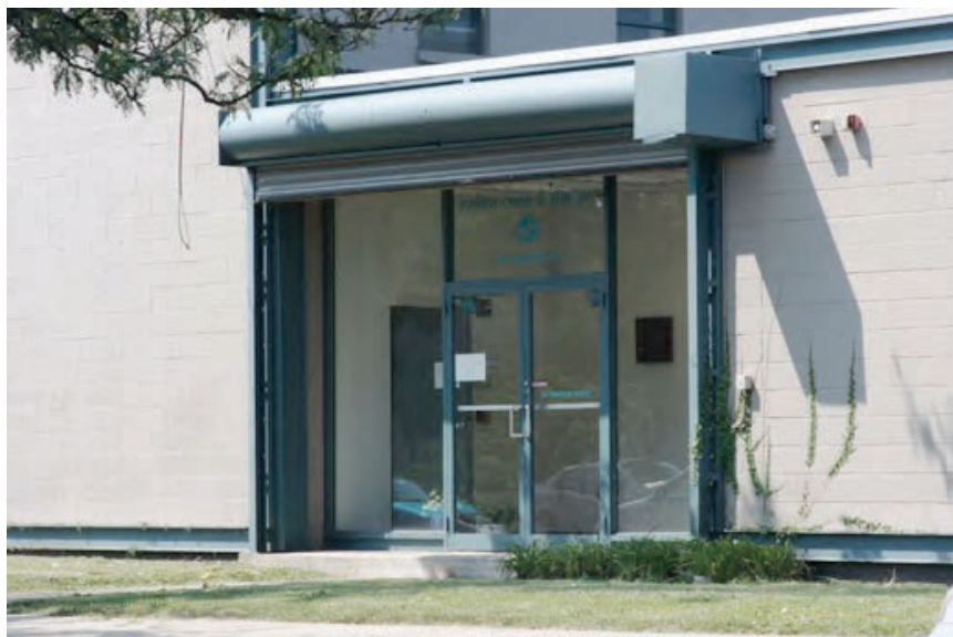
3. East view of entry doorway, camera facing west.