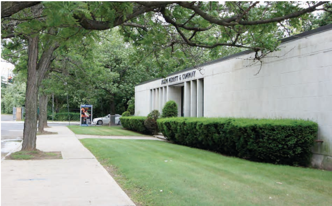
North view from Hamilton Street facing west.

Architecture of the building was a mix of styles. The building was designed by the architect Joseph Merritt & Company. The building is a prime example of the architectural style of the early 20th century. The building is a prime example of the architectural style of the early 20th century. The building is a prime example of the architectural style of the early 20th century.