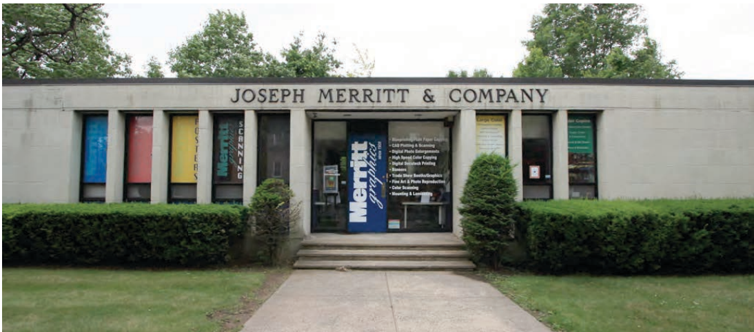
East view from sidewalk facing east.