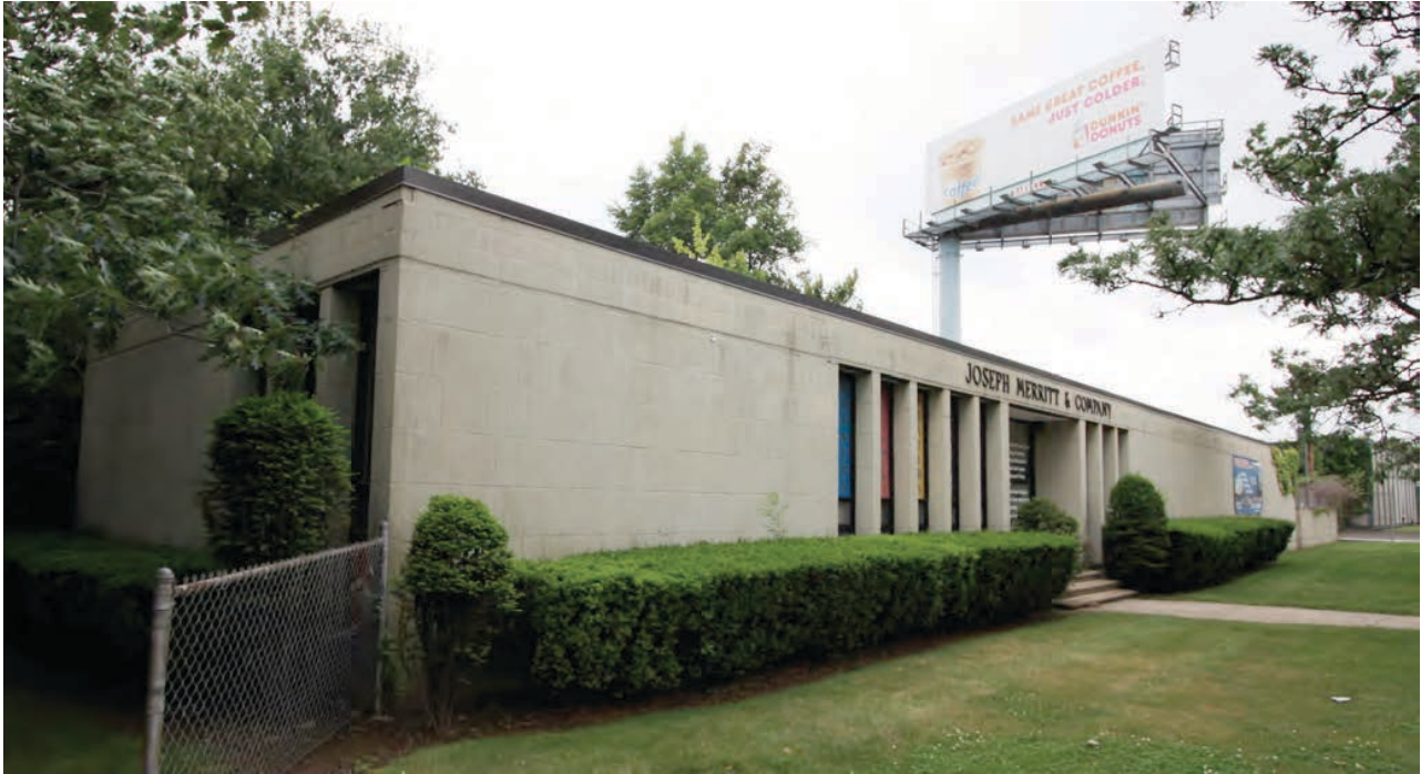
3 a a stvief n 6 p 6 tre ad Hamil 6 tre a me ad i g tlv 6 .