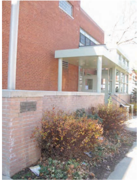
2. East view of Fillmore Street façade and entry, Camera facing northwest.