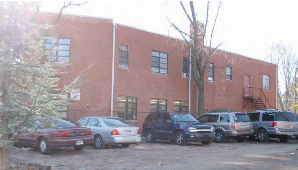
3. North view of side elevation from adjacent parking area, camera facing south.