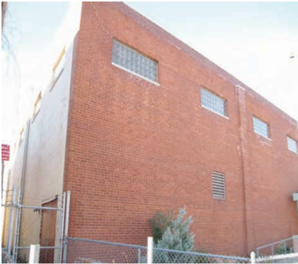
1. Southeast view of Fillmore Street façade and south wall, camera facing west.