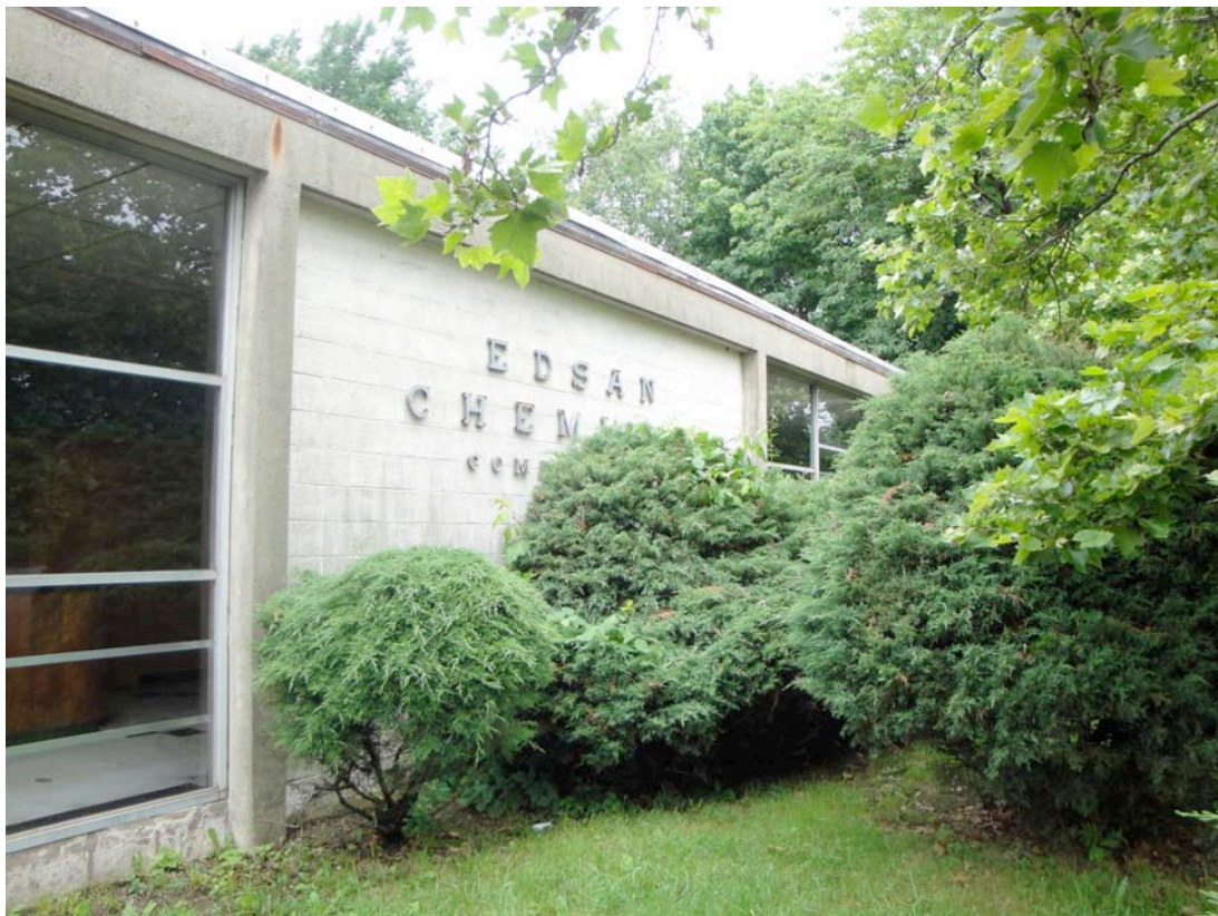
2. Northeast view from East Street, showing center bay of facade, camera facing northwest..