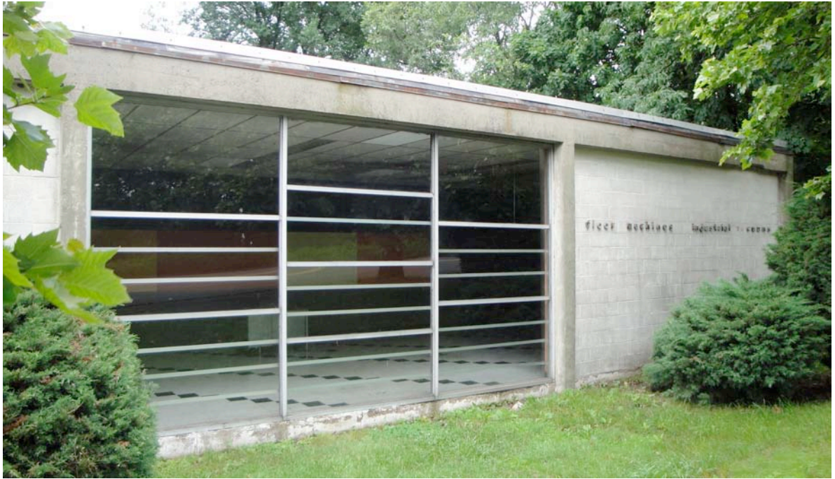
1. Northeast view from East Street, showing 4th and 5th bays of facade, camera facing northwest..