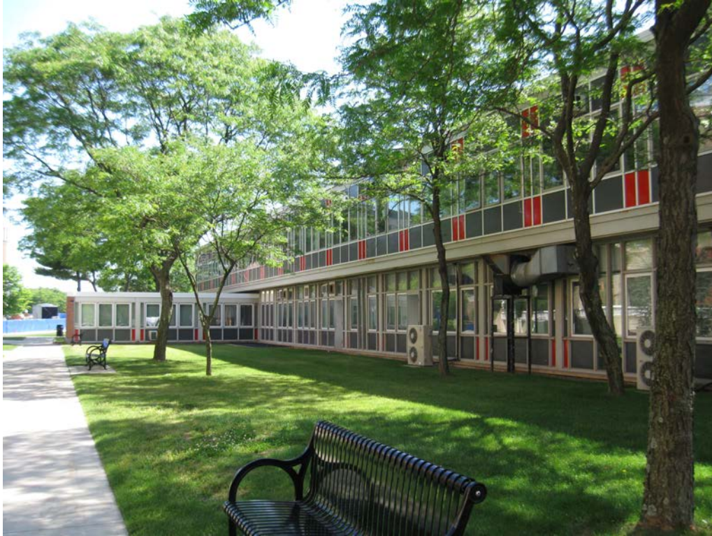
3. West view, camera facing northeast.