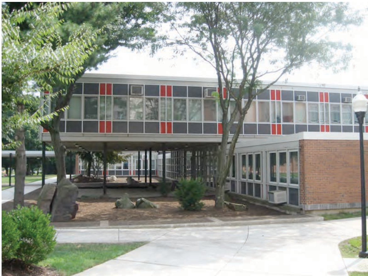
2. Northwest view from central campus plaza, camera facing east.