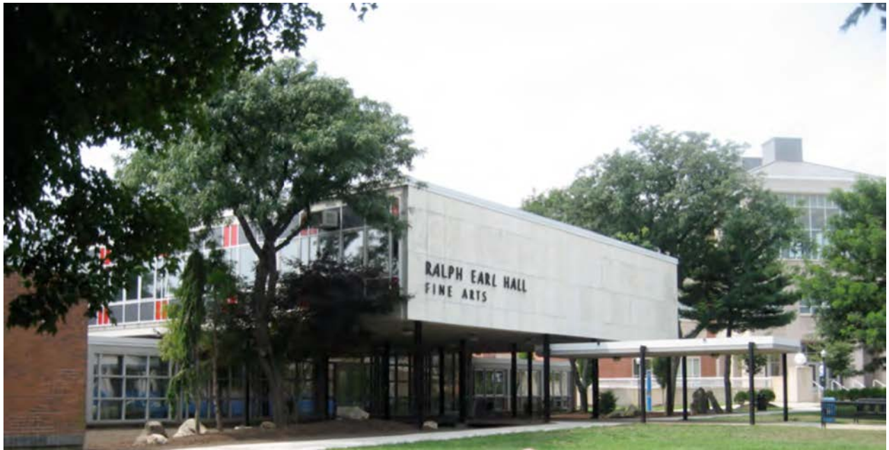
1. North (front) elevations from the central campus plaza, camera facing southwest.