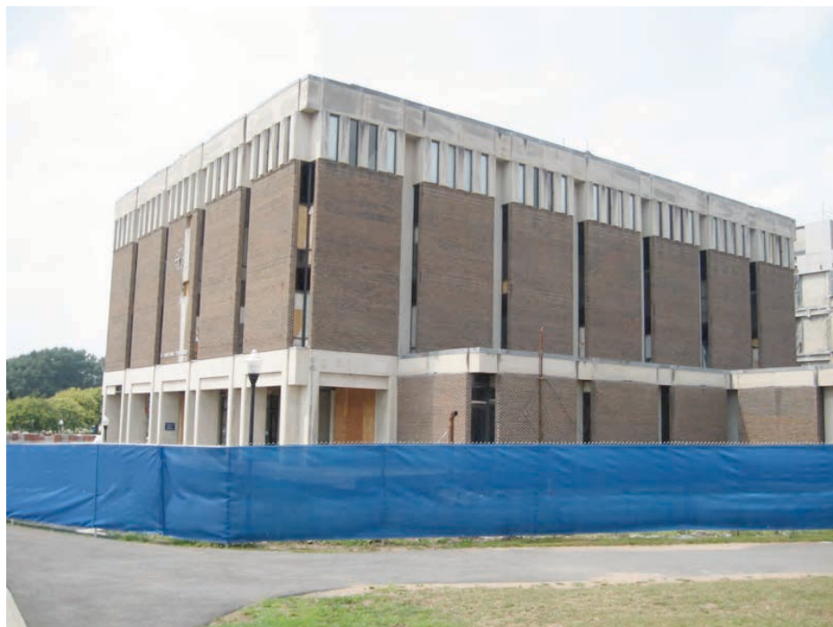
2. South (front) and east (side) elevations from central plaza, camera facing northwest.