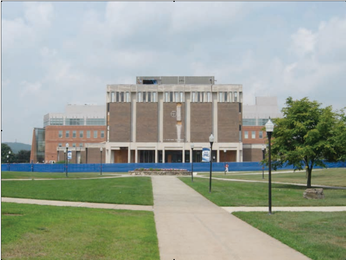
1. South (front) elevation from central plaza, camera facing north.