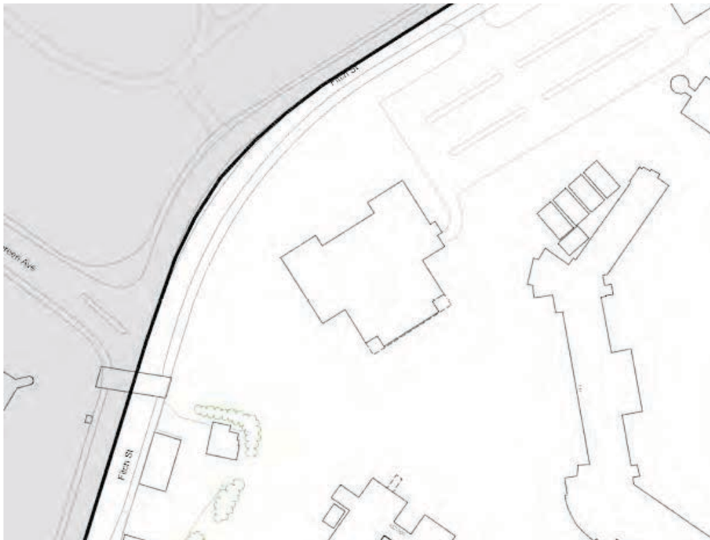
4. Site Plan – detail from City of New Haven Tax Map 359/1160/001, not to scale, North ↑.