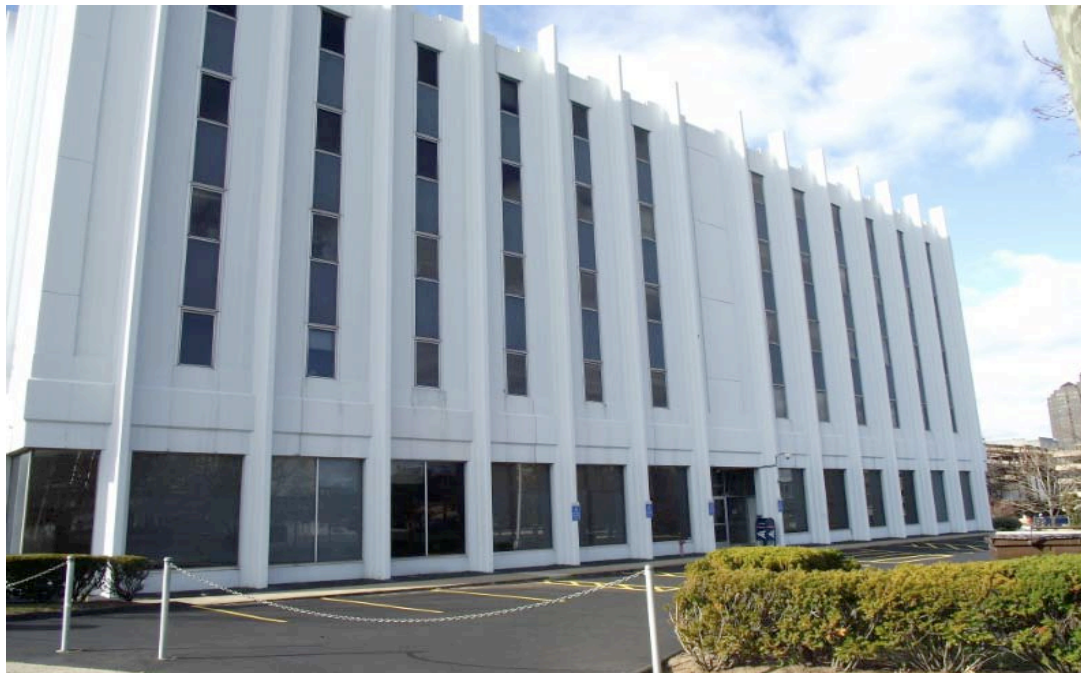
2. East view from Lafayette Street, camera facing northwest.