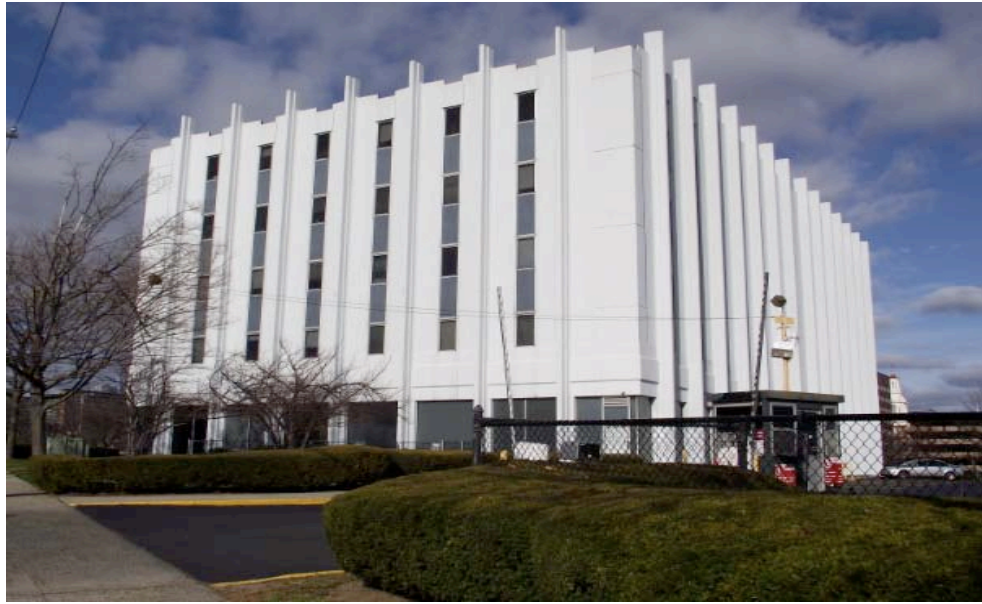
1. South view from Lafayette Street, camera facing north.