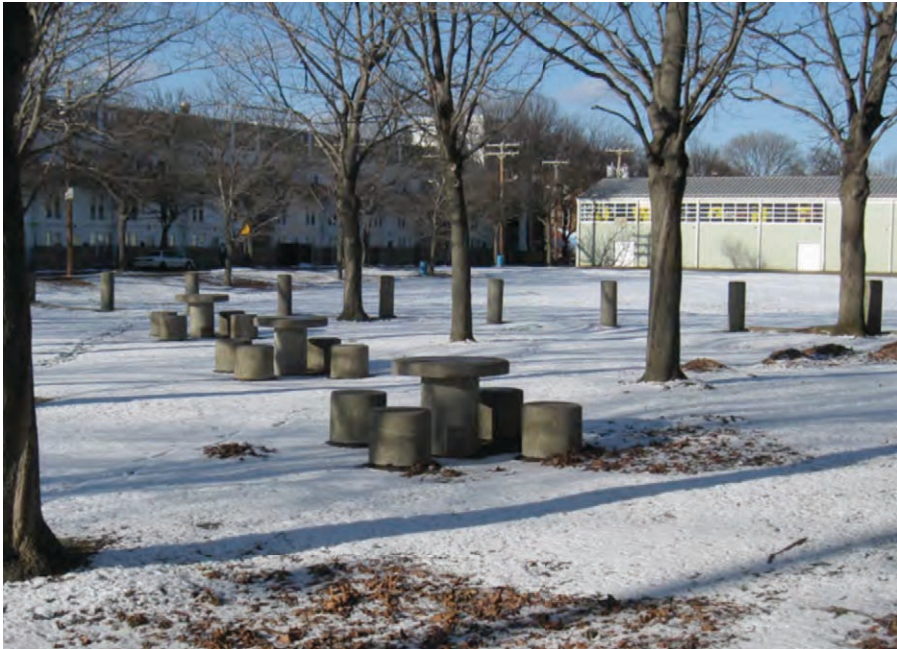
1. View from Chapel Street, camera facing NW toward Garden Street.