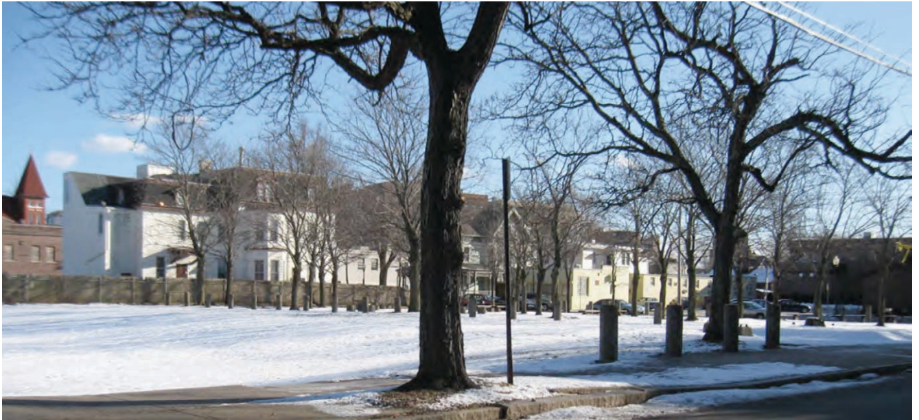
2. View from Garden Street toward Chapel Street, camera facing SE.