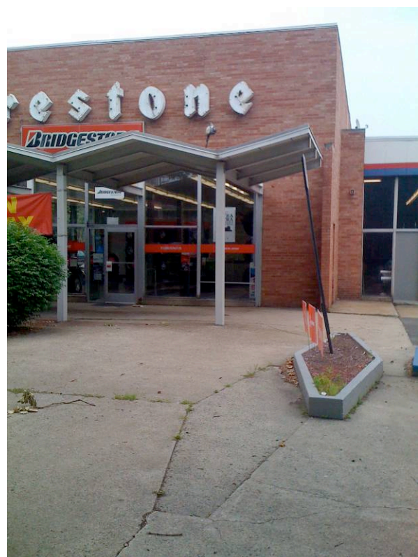
4. Landscape detail at west plaza