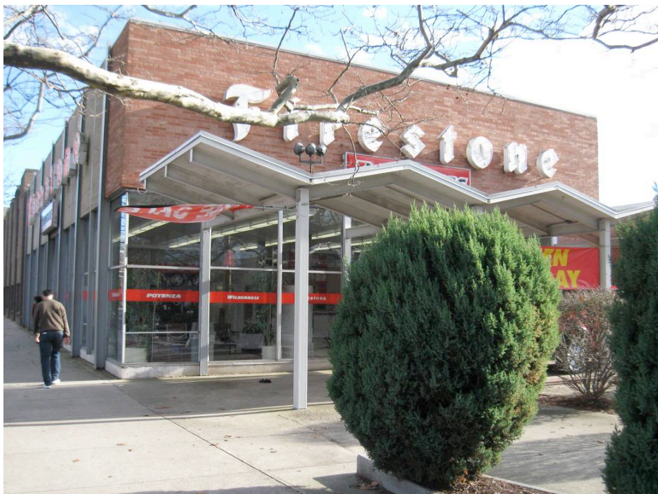
1. Northwest view from Chapel Street, camera facing southeast.

The service wing is open on its west side, with partially glazed overhead doors alternating with glass walls which bring light into the work space and allow the public to view the work ongoing. The south end of the service wing is anchored by a thick masonry slab of the same red brick used on the sales room block. The rear wall of this wing is constructed of concrete masonry with brick veneer and overhead doors corresponding to the front, allowing vehicles to continue out the back. A period photograph appears to show a gasoline pump at the Union Street side near the street line; this is no longer extant.