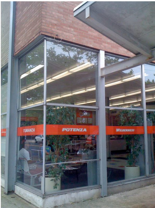
3. Northwest corner window detail