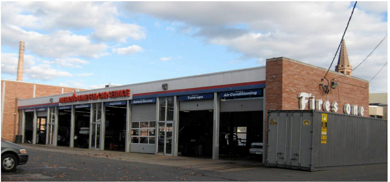
2. Southwest view of service bays from Union Street, camera facing northeast.