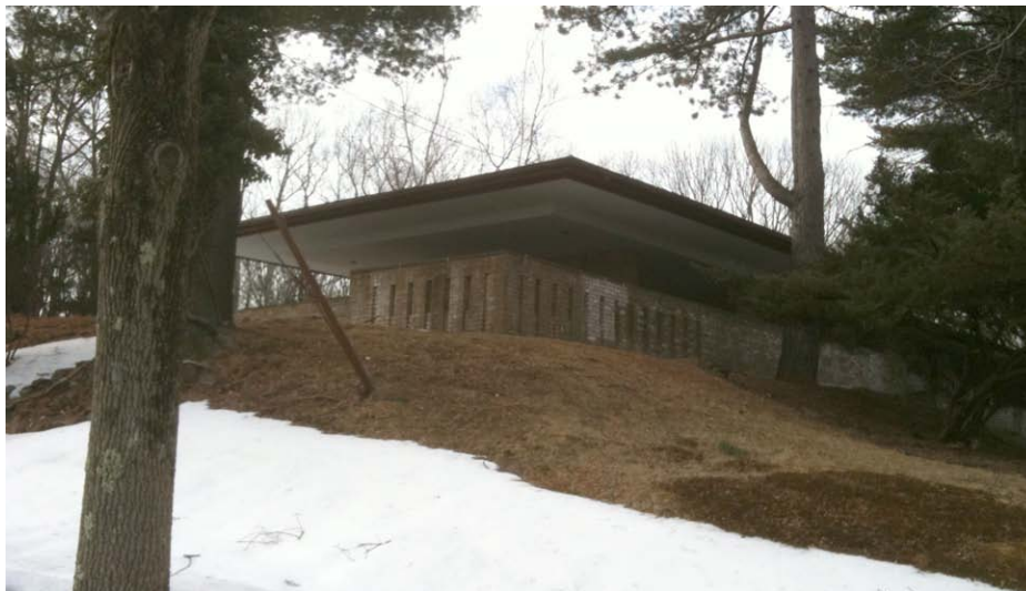
2. Southeast view from Stevenson Road, camera facing northwest.