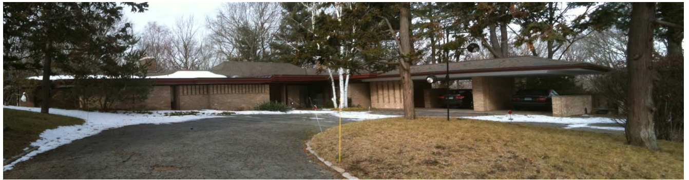
1. South view from Stevenson Road, camera facing north.