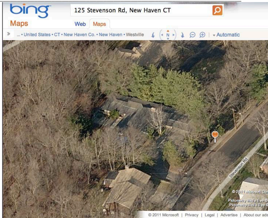
4. South aerial view from Bing Maps http://www.bing.com/maps/ accessed 1/19/2011.