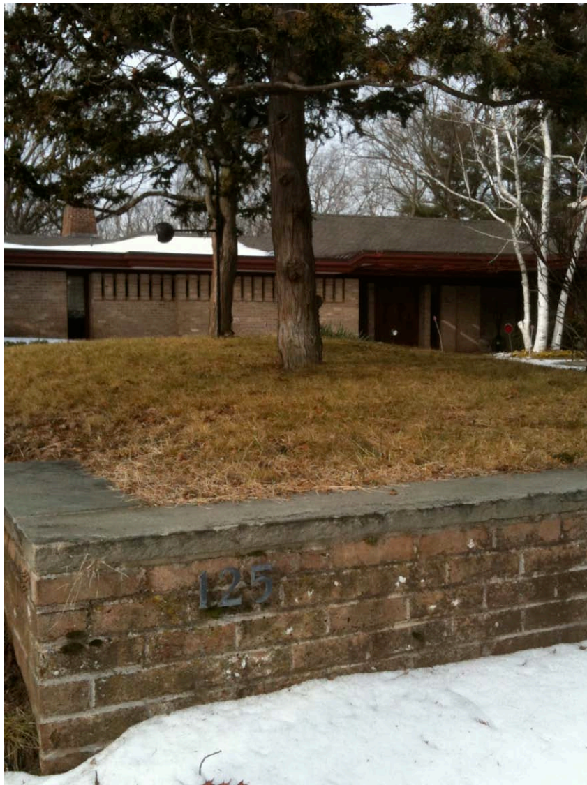
3. South detail view of raised front yard garden from Stevenson Road, camera facing north.