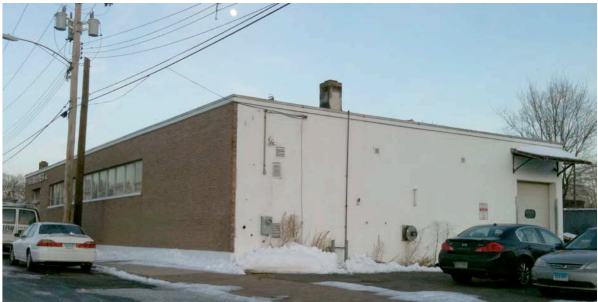
2. Southwest view from Printers Lane, camera facing north.