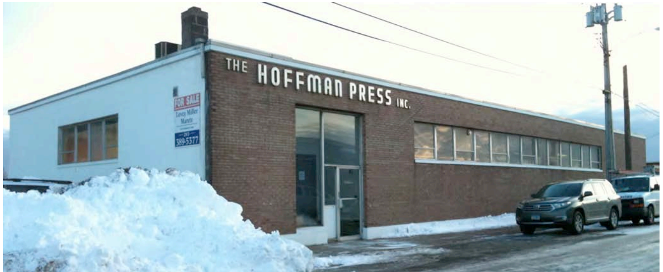
1. Northeast view from Printers Lane, camera facing south.