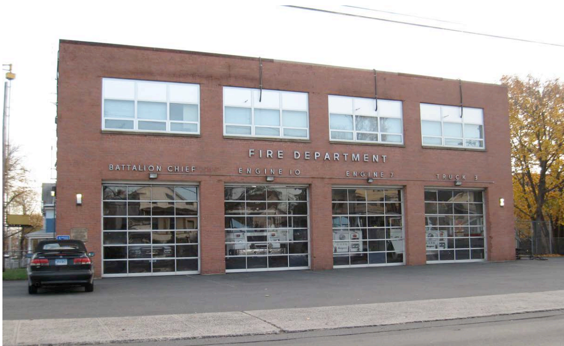
1. North view from Lombard Street, camera facing south.