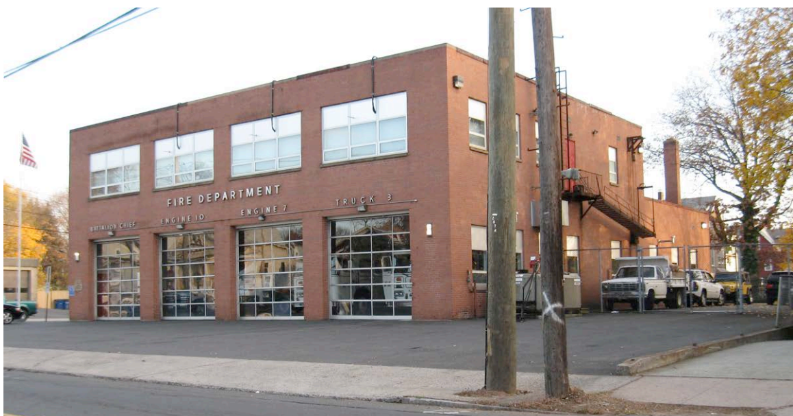
2. Northwest view from Lombard Street, camera facing southeast.