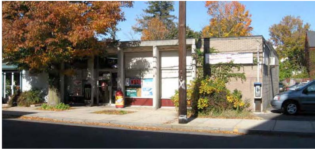
1. South (front) elevation from Grand Avenue, camera facing north.