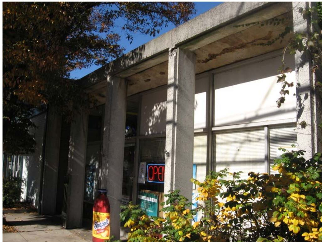
2. South (front) elevation from Grand Avenue, camera facing northwest.